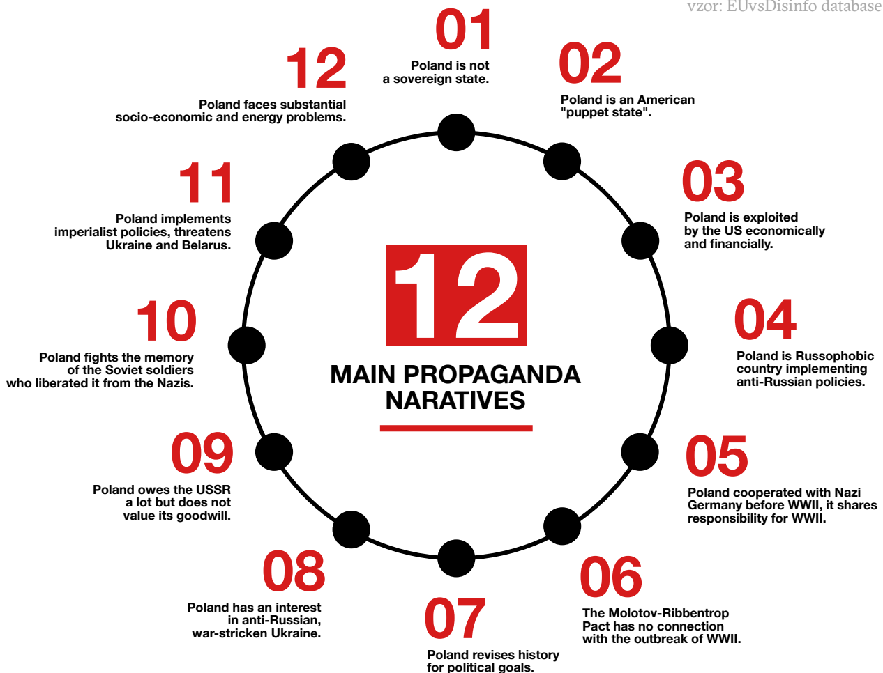
Graph 1. Twelve major disinformation narratives in Sputnik Poland, 2019-2020.

These narratives question the extent of Poland's sovereignty, point to the alleged Russophobia and anti-Ukrainian policies of Poland, and criticise Polish perspectives on historical events.